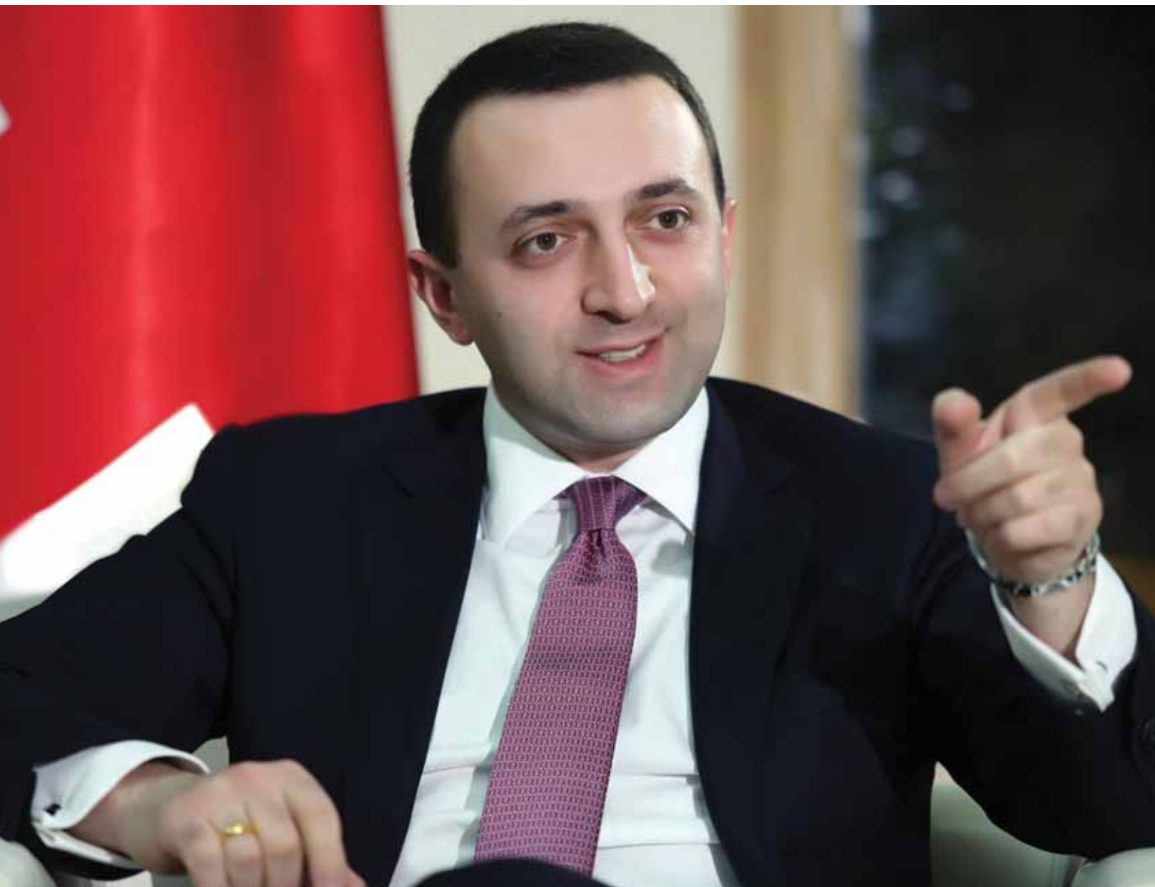
Georgian Prime Minister Irakli Gharibashvili