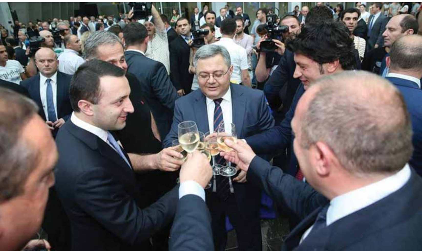
Georgian PM Irakli Gharibashvili, Parliament Speaker Davit Usupashvili, Energy Minister Kakha Kaladze and Georgian President Giorgi Margvelashvili celebrate the ratification of the EU agreement

leverage over the country and mute EU concerns over egregious violations of human rights and serious shortcomings in democratization and reform.