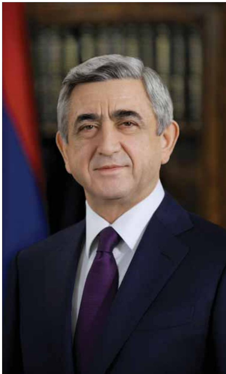
Armenian President Serzh Sargsyan