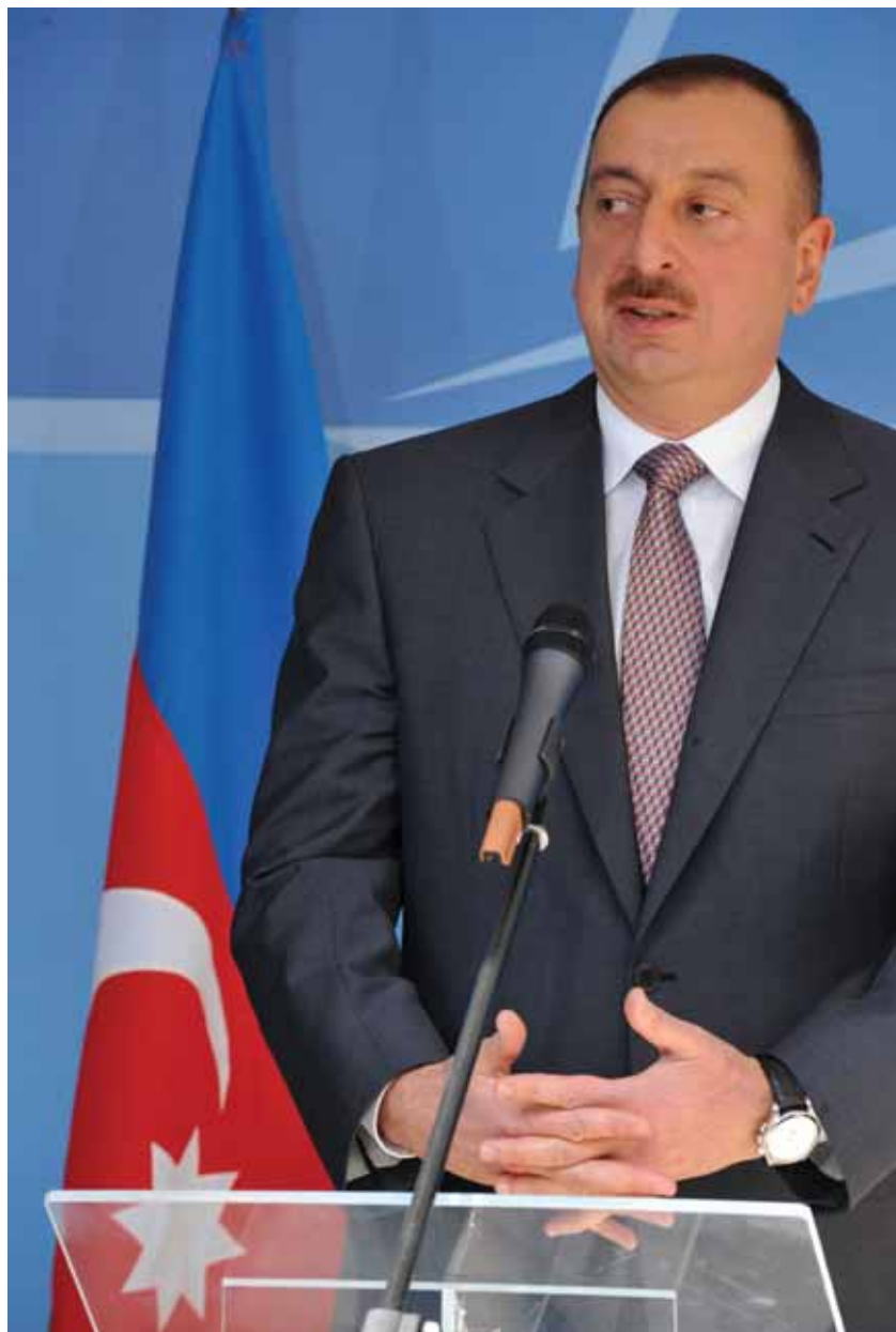
Azeri President Ilham Aliyev