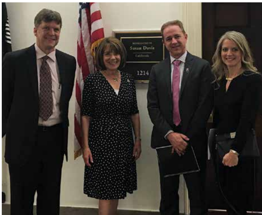
Meeting with Susan Davis, Representative California

In addition, we pointed out that America needs to maintain continued high-level connections at a government level. As everyone in Georgia knows, Georgia looks better ‘close-up’ so we strongly encouraged the Representatives to visit Georgia as an expression of support, to allow us to show Georgia’s famous hospitality and in order to see the successes close-up. Quite a few of the Representatives we met said that they would visit and we look forward to